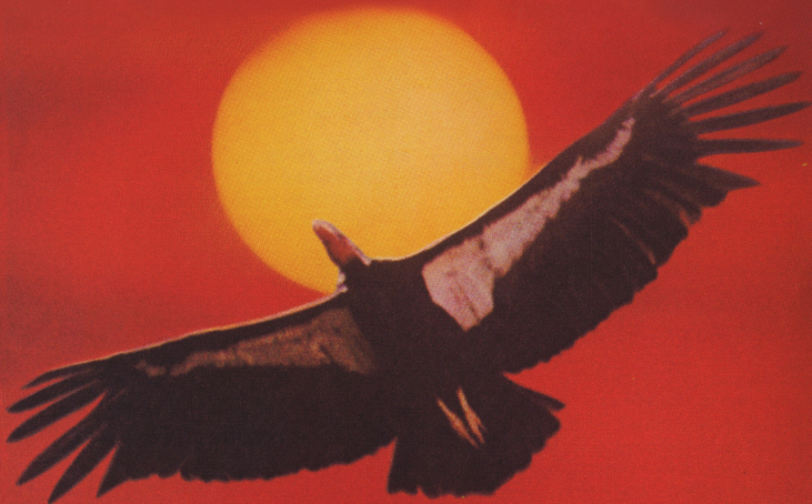
The California Condor, with a wing-span of over nine feet, is the largest bird in North America, and one of the rarest.